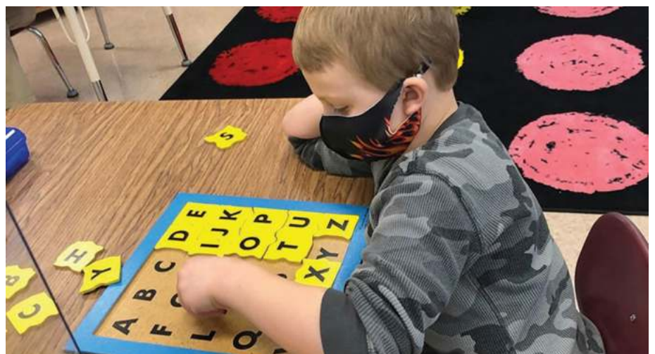
A student works during in-person learning at Adams-Friendship Elementary School.